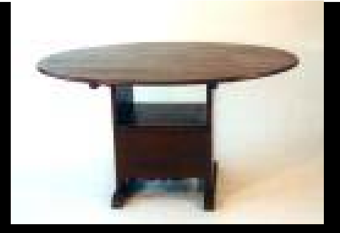
Table (Arabic: Tarabeza)