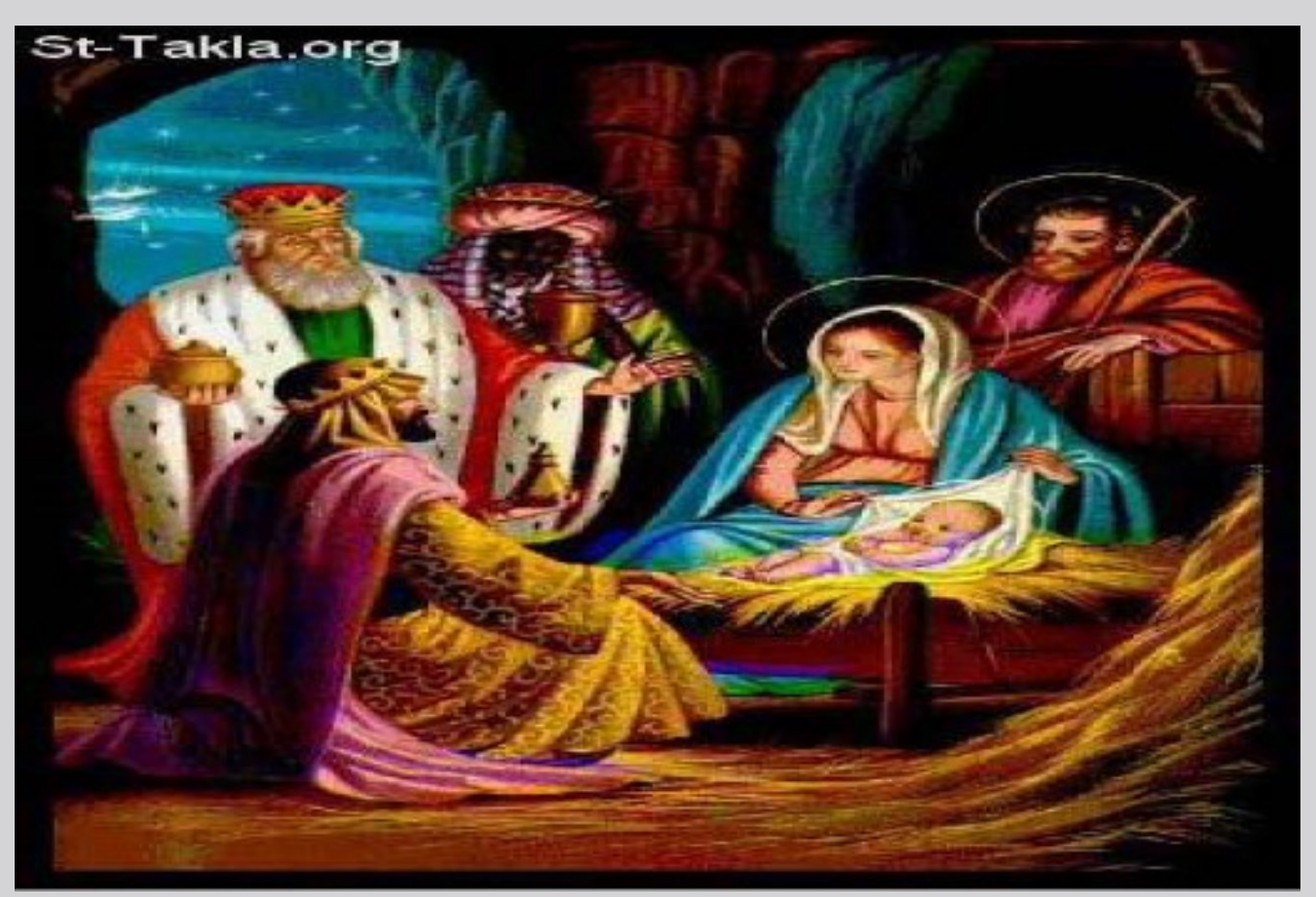
©2016 Coptic Orthodox Diocese of the Southern United States, 501(c)3 organization