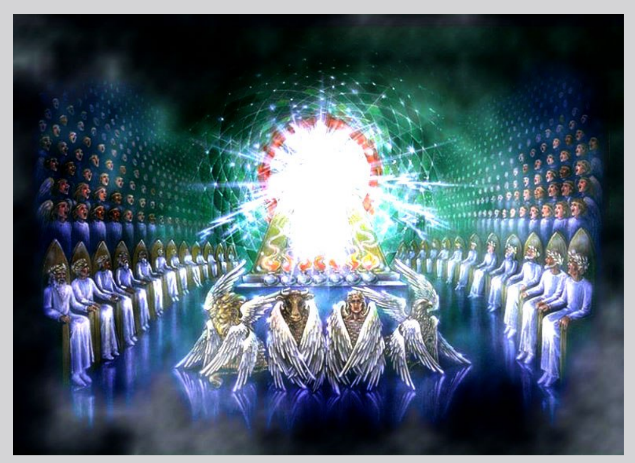
©2016 Coptic Orthodox Diocese of the Southern United States, 501(c)3 organization

The book of Revelation describes God on the Throne with 24 priests, 4 creatures and lightning all around.