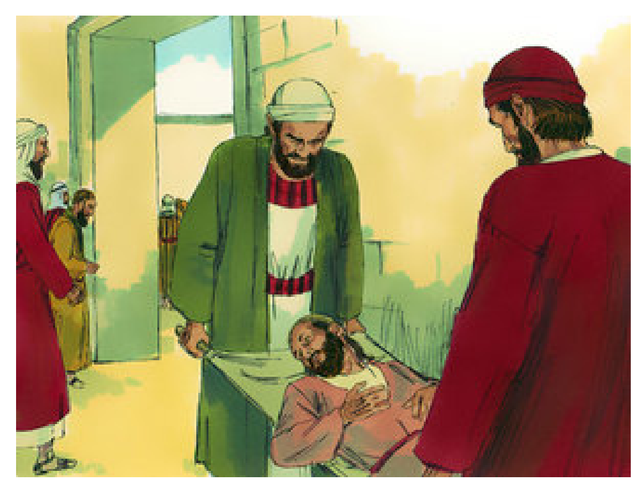
©2016 Coptic Orthodox Diocese of the Southern United States, 501(c)3 organization