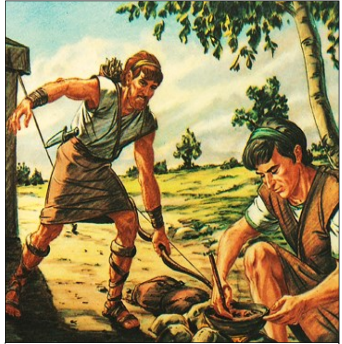
“Lie not to one another” (Colossians 3:9)