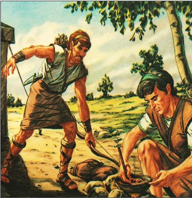
“Lie not to one another” (Colossians 3:9)