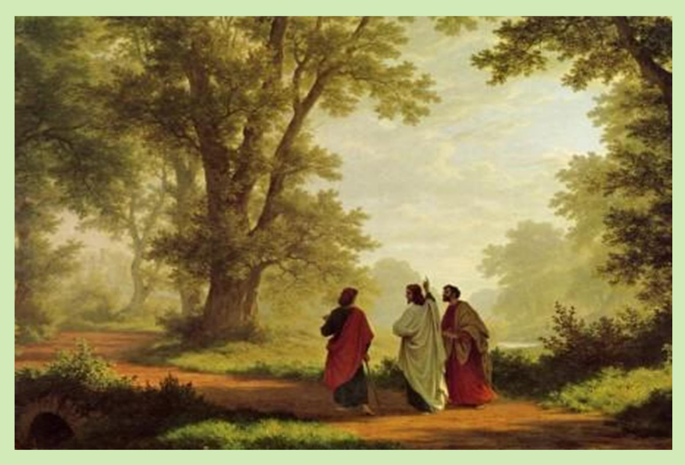
©2016 Coptic Orthodox Diocese of the Southern United States, 501(c)3 organization