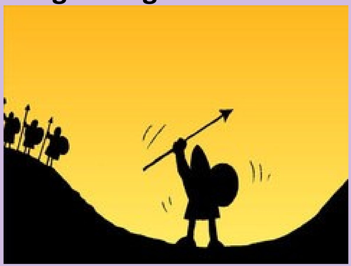
©2016 Coptic Orthodox Diocese of the Southern United States, 501(c)3 organization

Saul prepared the Israelite army to fight Palestine but neither army had the courage to fight.