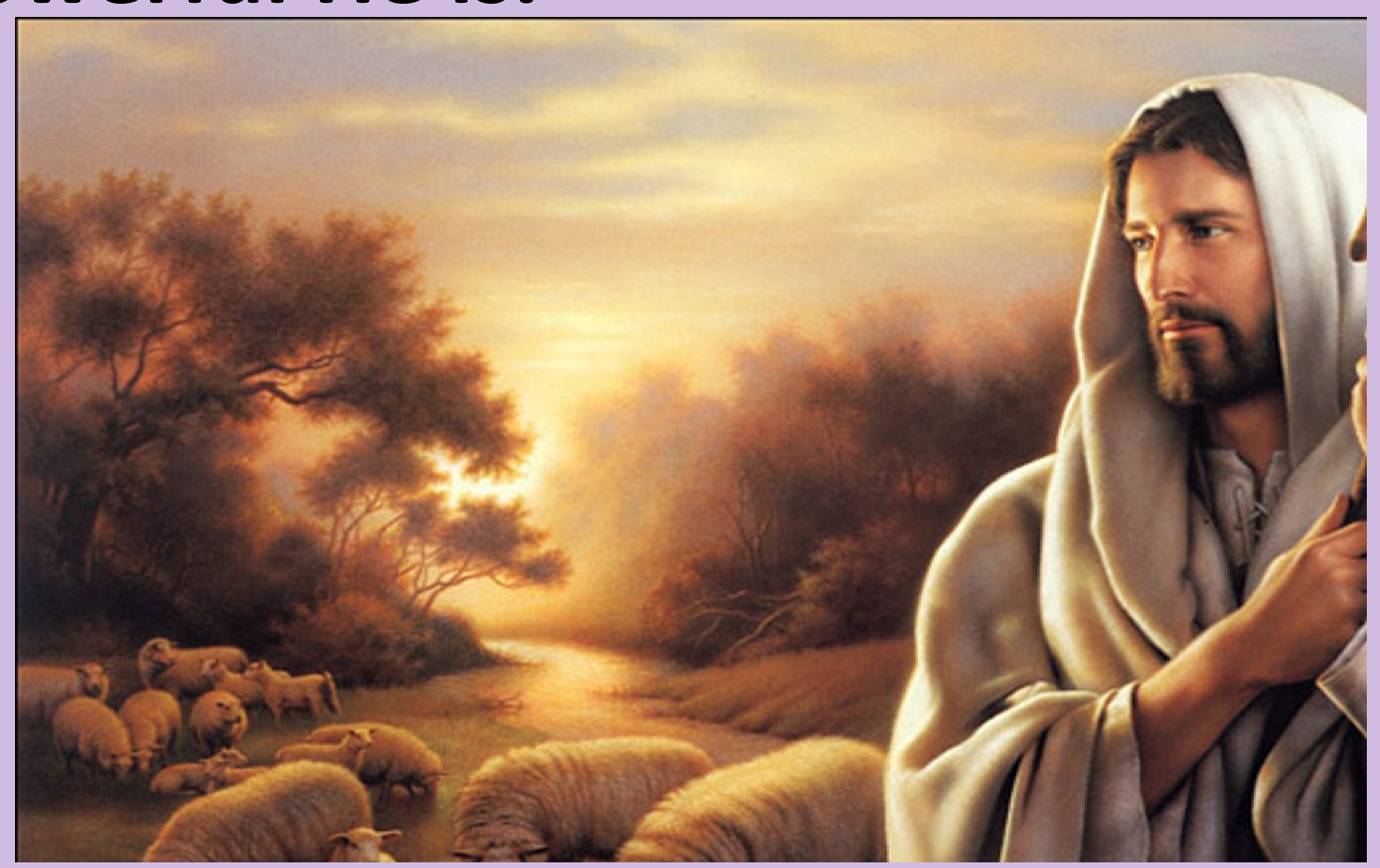
©2016 Coptic Orthodox Diocese of the Southern United States, 501(c)3 organization

Objective: Explaining how the Lord cares about His people and how powerful He is.