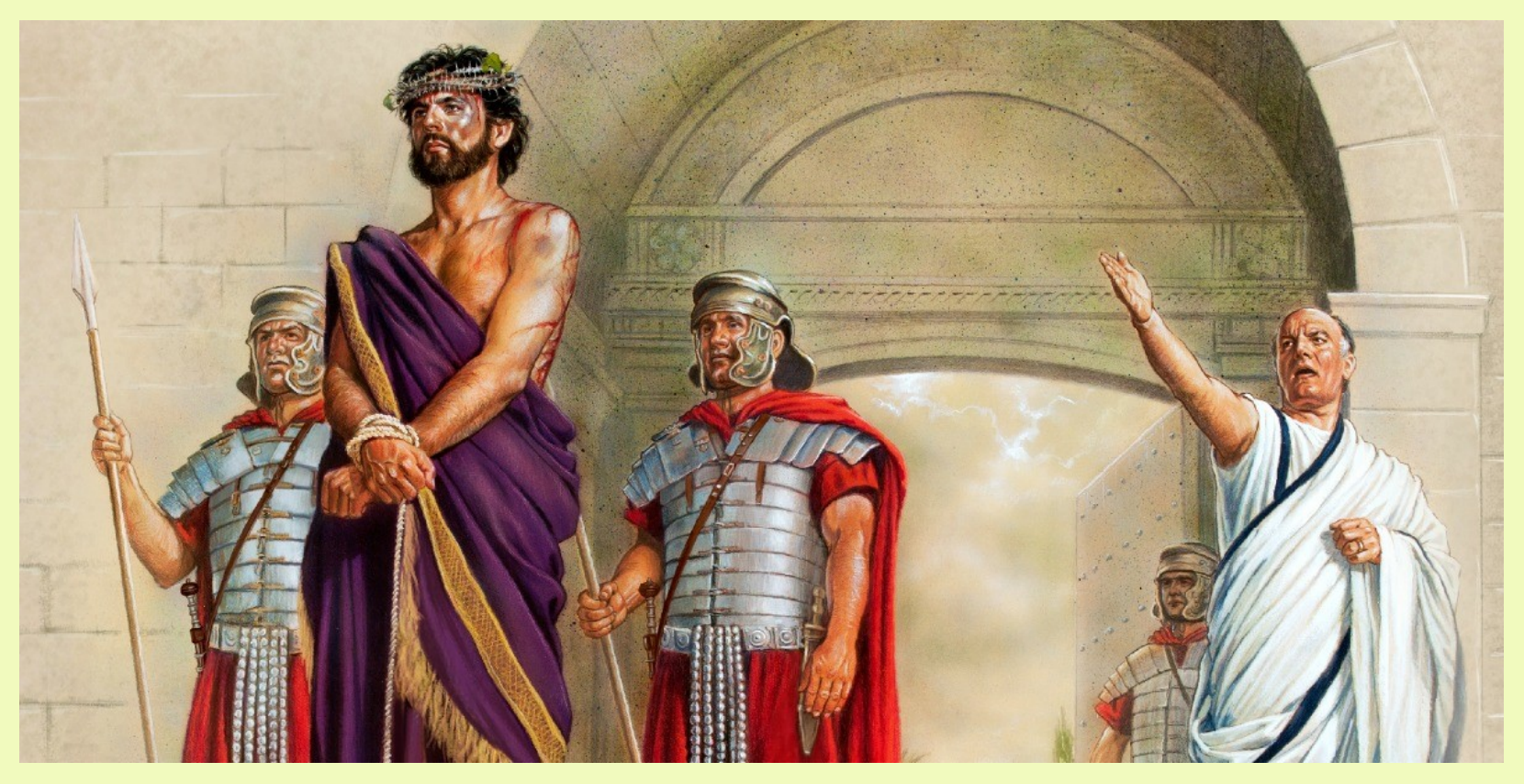
©2016 Coptic Orthodox Diocese of the Southern United States, 501(c)3 organization

Jesus rejects violence in all its aspects, when He was interrogated by the religious leader of the Jews.