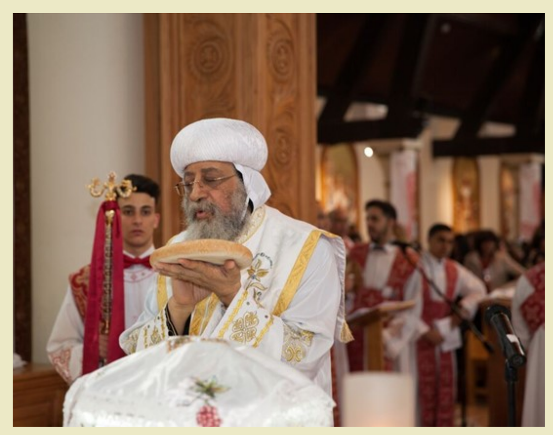
©2016 Coptic Orthodox Diocese of the Southern United States, 501(c)3 organization

Objective: To teach the students the importance of observing holy Sunday and devoting it to worship and service.